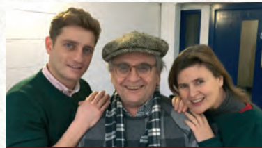
Above (left to right): Philip Olivier, Sylvester McCoy and Sophie Aldred