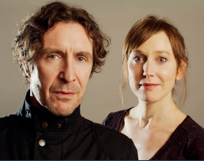
Above: Paul McGann and Hattie Morahan