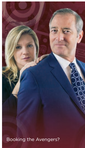
Booking the Avengers?