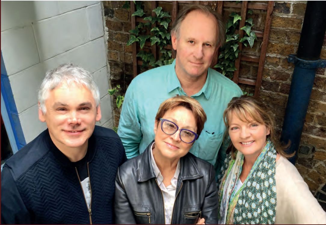
Above (left to right): Matthew Waterhouse, Janet Fielding, Peter Davison and Sarah Sutton

act of creation than of recreation. It is important to me that, with allowances, the character feels as near as possible the way he did on TV! Not many actors in their fifties get to play children! I suppose it is a bit like being one of those old-fashioned rep actors who might be cast as an old bloke in one play and a lad in the next!"