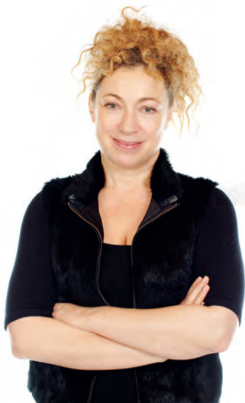
Above: Alex Kingston