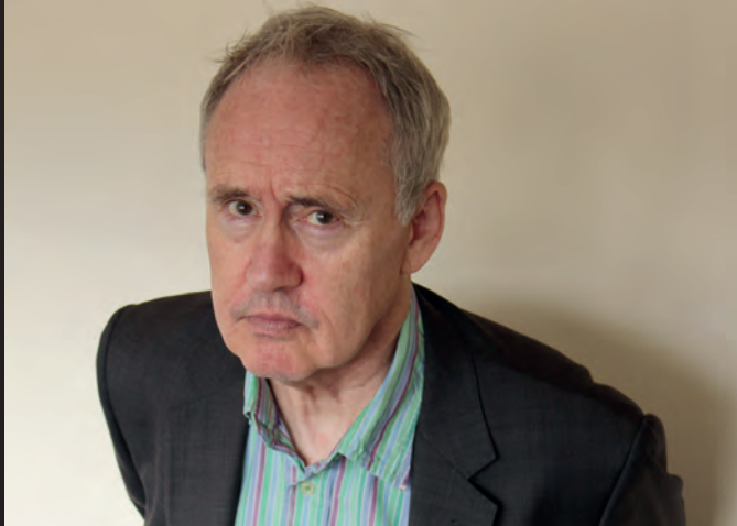
Above Nigel Planer • Below (left to right): John Heffernan and Ronald Pickup

“ I WAS HALF-CONVINCED THAT IT WAS IMPOSSIBLE. WHICH IS ALL I REALLY NEEDED TO MAKE ME SAY YES. ”