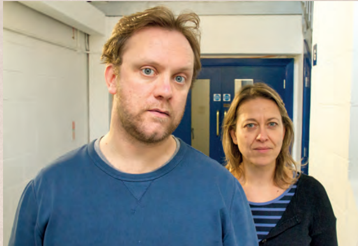
Above (left to right): Sam Troughton and Nicola Walker

me, I wept when I read it. It was like a much loved, long forgotten friend coming back into my life and bringing back all those lovely feelings anew."