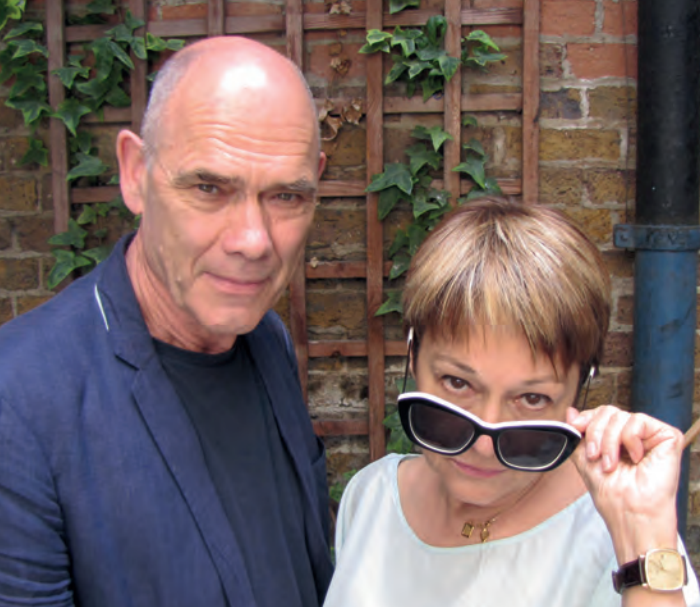
Above (left to right): Peter Guinness and Janet Fielding