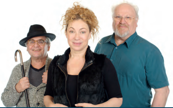
Above (left to right): Sylvester McCoy, Alex Kingston and Colin Baker

trousers on (I presume she must have been wearing mine, I certainly haven't seen them since!). She's a great character played by a great actor, so utterly painless to write. The challenge I set myself for this one was to avoid my usual fall-back position of getting carried away with quipping dialogue, it's actually quite a straight, dark story."