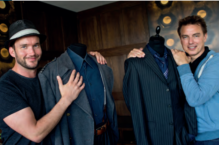
Above: Gareth David-Lloyd and John Barrowman • Below: Eve Myles and Russell T Davies

He laughs: "In some ways it's actually harder because people will know what it should sound like,