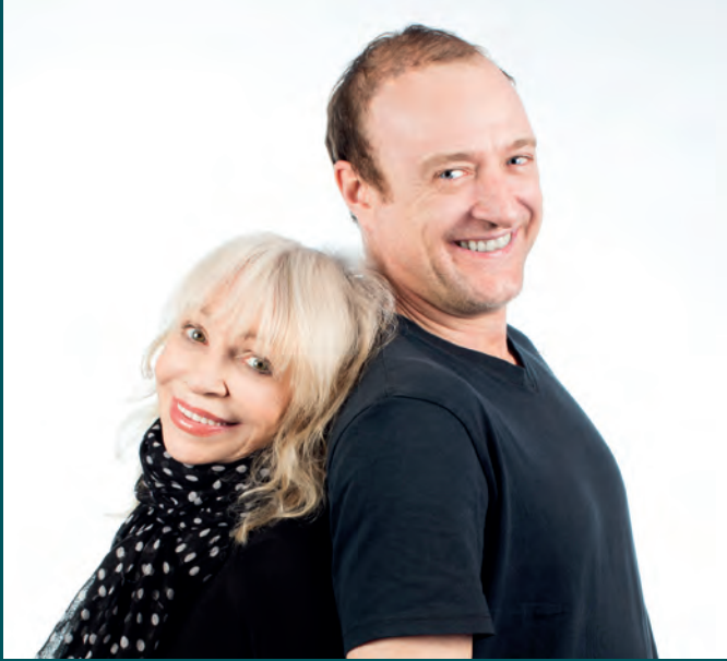
Above: Katy Manning and Tim Treloar