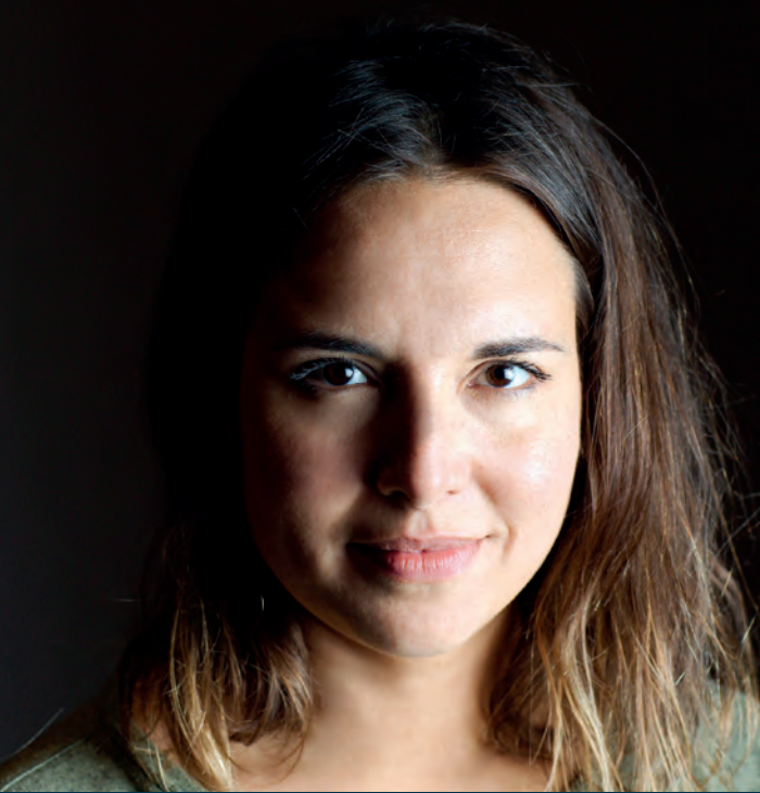
Above: Ingrid Oliver

all hit the ground running and enjoy bringing these action-packed stories to life. The result is everyone gets on like a house on fire. Three box sets in and I know everybody's happy and confident because they're taking the mickey out of me more and more!"