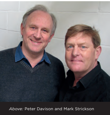
Above: Peter Davison and Mark Strickson

early on better enables you to accommodate interesting ideas that you and/or the writers might come up in the process. Often your first idea isn't necessarily the best one.