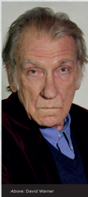
Above: David Warner