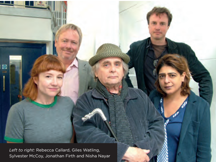
Left to right: Rebecca Callard, Giles Watling, Sylvester McCoy, Jonathan Firth and Nisha Nayar