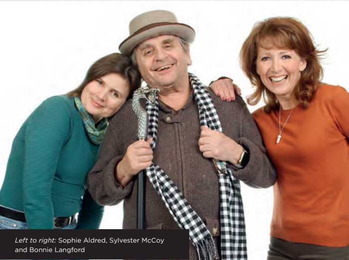
Left to right: Sophie Aldred, Sylvester McCoy and Bonnie Langford