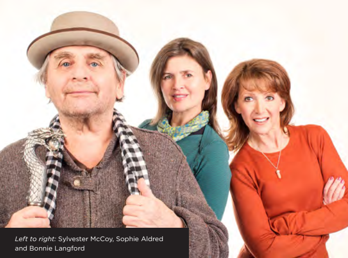
Left to right: Sylvester McCoy, Sophie Aldred and Bonnie Langford