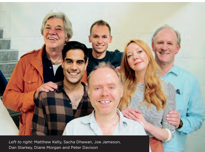
Left to right: Matthew Kelly, Sacha Dhawan, Joe Jameson, Dan Starkey, Diane Morgan and Peter Davison