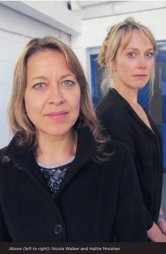
Above (left to right): Nicola Walker and Hattie Morahan