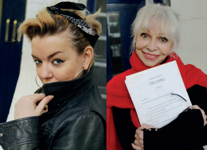
Above: Sheridan Smith