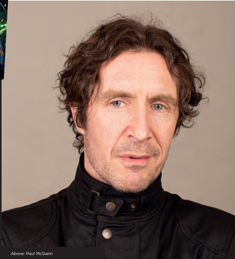
Above: Paul McGann