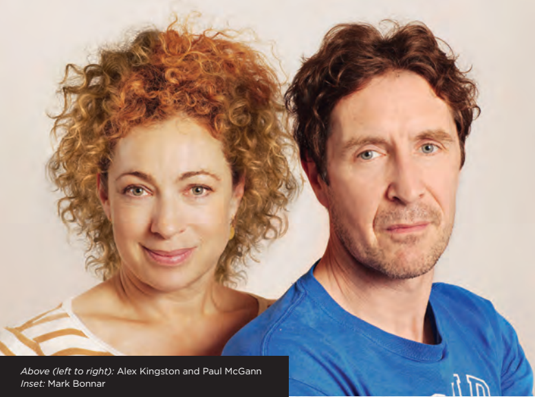
Above (left to right): Alex Kingston and Paul McGann Inset: Mark Bonnar

"He's pretty hard to pin down, which is one of the joys of playing him – he never gets predictable. The only predictable thing about him is his desire for power. That's about the only thing you can definitely say about him!"