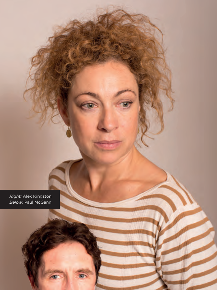
Right: Alex Kingston Below: Paul McGann