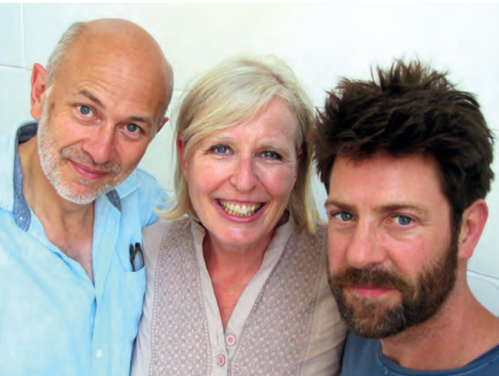
Above (left to right): Vincent Franklin, Jacqueline King and Hamish Clark