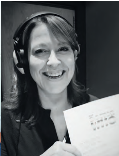
Above: Nicola Walker