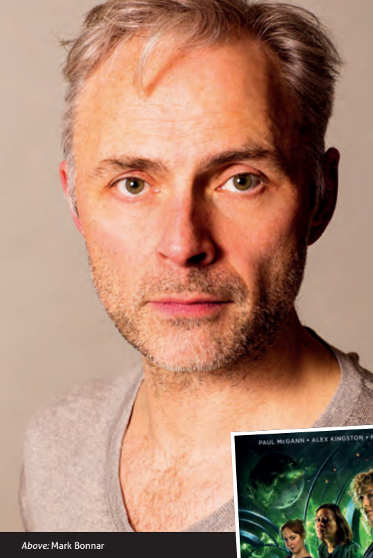
Above: Mark Bonnar

“I love passion and enthusiasm and I’m always fascinated to talk to people who have liked work I’ve been involved in. It’s interesting and rewarding to meet people who are passionate.” Hattie Morahan