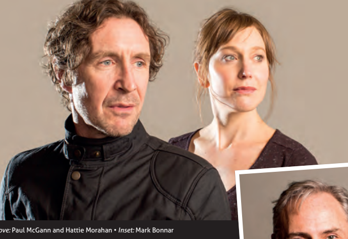
Above: Paul McGann and Hattie Morahan • Inset: Mark Bonnar