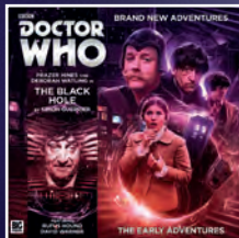
THE BLACK HOLE by Simon Guerrier OUT: DECEMBER