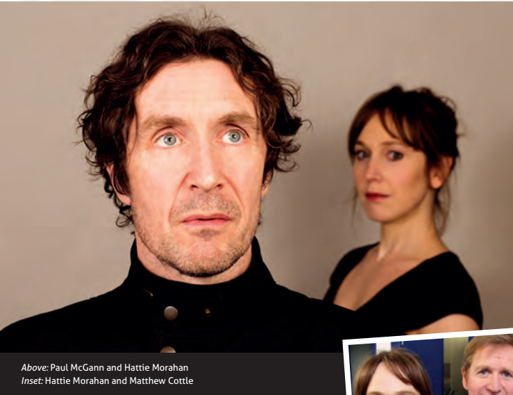
Above: Paul McGann and Hattie Morahan Inset: Hattie Morahan and Matthew Cottle