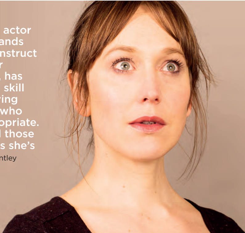
Above: Hattie Morahan