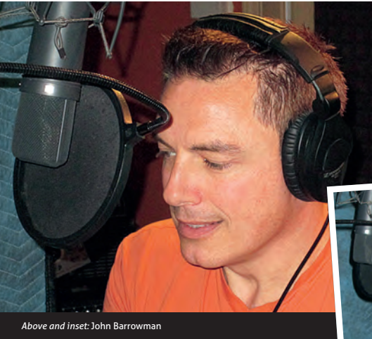
Above and inset: John Barrowman

“Torchwood is just so very Cardiff – ambitious and tough but also outrageous.”