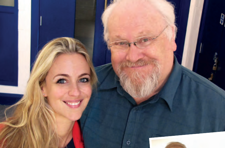
Above: Miranda Raison and Colin Baker Inset: Michael Jayston and Bonnie Langford