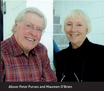
Above: Peter Purves and Maureen O'Brien