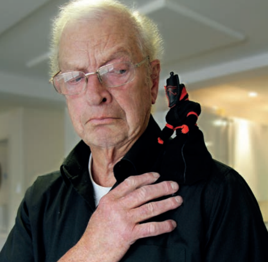
Above: Gabriel Woolf • Inset: Sylvester McCoy