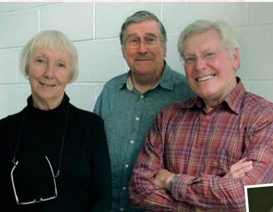
Above: Maureen O'Brien, Tony Millan and Peter Purves Inset: Peter Davison