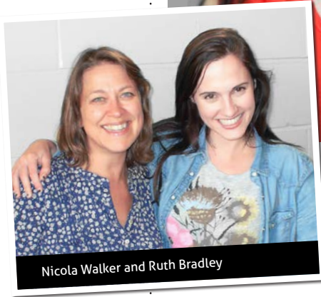
Nicola Walker and Ruth Bradley

I would like them somehow to move forward together in some way.