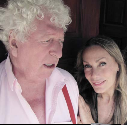
Above: Tom Baker and Virginia Hey

Big Finish and they do lots of audiobooks. You should talk to him and see if they have any characters for you, because that would be amazing for you to do when you settle in to the UK.' So I approached him because I don't have an acting agent yet, and I just said, 'Oh my God, I would love to do some audiobooks and voiceovers,' and he said, 'Okay, I'll keep you in mind'. He approached me a few weeks ago and said, 'Right, we've got a character for you'. And here I am. I'm really chuffed! It's my first job in England!