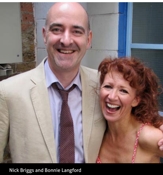
Nick Briggs and Bonnie Langford

■ The weird thing was, I never went near a computer! A person who is a computer programmer at that time would never have been away from some device. I think I pressed a couple of buttons on the TARDIS once but that was it. So to be honest, that in itself was pretty unrealistic, although