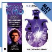
THE GUARDIANS OF PROPHECY

THE SIXTH DOCTOR TAKES ON MELKURS, SONTARANS... AND AN OLD FRIEND WHO WANTS HIM DEAD