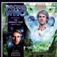
THE EMERALD TIGER APRIL 2012

A NEW MINI-SEASON TAKES THE FIFTH DOCTOR AND HIS COMPANIONS TO INDIA, OUTER SPACE... AND INTO THE CLUTCHES OF MAGNUS GREEL