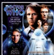
THE JUPITER CONJUNCTION MAY 2012