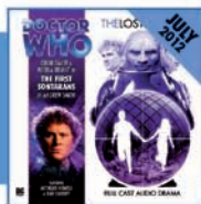
THE FIRST SONTARANS

STORIES DEVISED FOR TELEVISION... NOW AVAILABLE TO HEAR FOR THE FIRST TIME