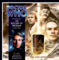
THE BUTCHER OF BRISBANE JUNE 2012

ORDER FROM BIGFINISH.COM AND ALL GOOD BOOKSHOPS CREDIT CARD HOTLINE 01628 824102 FREE UK DELIVERY ON EVERYTHING