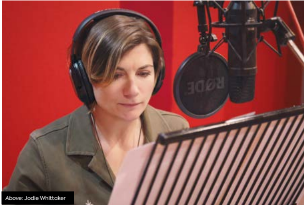
Above: Jodie Whittaker

time for the festive season. Lionesses in Winter is about a dysfunctional family forced together for Christmas jollity when it's the last thing any of them are in the mood for. Sound familiar? And it becomes increasingly clear that supernatural unpleasantness is afoot, intrinsically linked to their family secrets and traumas. But it's fun too!