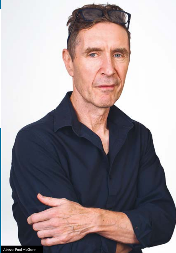
Above: Paul McGann

their wildest dreams and darkest nightmares, but are they truly ready to venture further out amongst the stars?