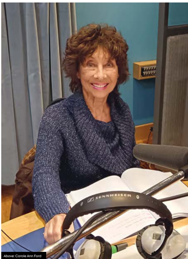
Above: Carole Ann Ford