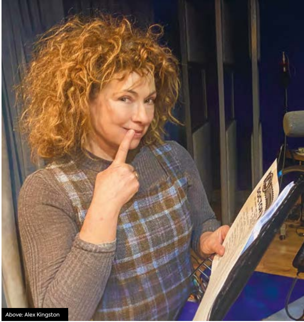
Above: Alex Kingston

"I've been listening to the final edits of Last Words and you can hear Alex's enthusiasm for the role in every scene. There's no better gift for a writer or director than to have a lead who's invested in the role and keen to keep exploring the possibilities. It becomes infectious in the studio, there's an energy about wanting to be there, wanting to enjoy the work and wanting to do good work that you can't fake. It lifts everybody's spirits. We're so lucky to get to work with Alex!" VORTEX