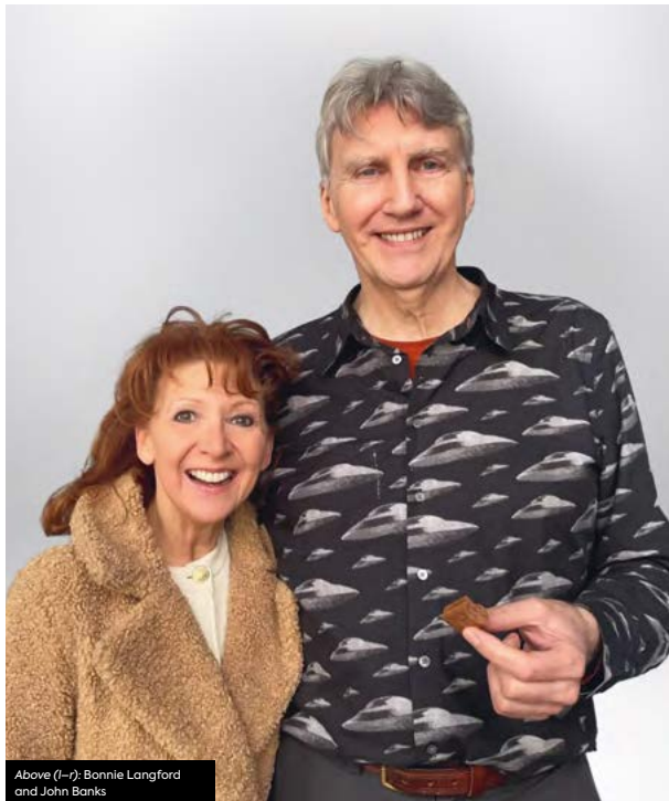
Above (l-r): Bonnie Langford and John Banks