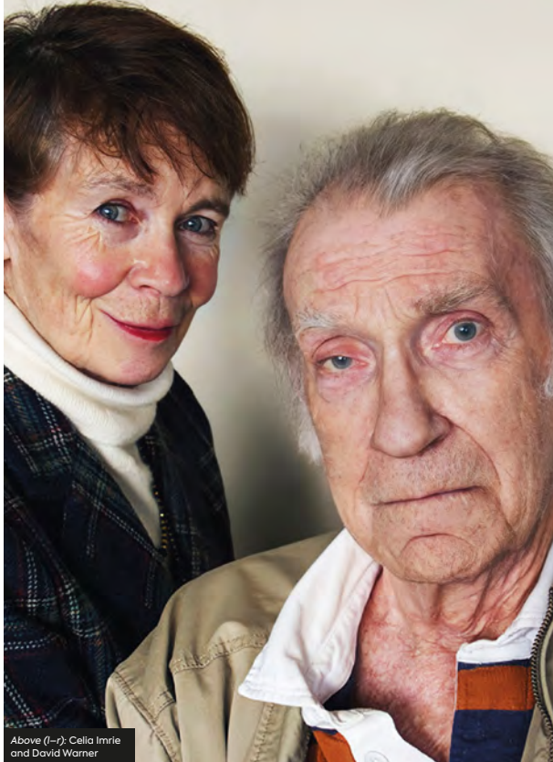
Above (l-r), Celia Imrie and David Warner

murder mystery serial I wrote between 1996 and 2021 (with a new episode every month) so there are lot more adventures to explore.