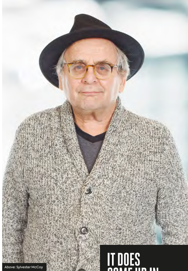
Above: Sylvester McCoy

story, because it does come up in conversation. You're going to begin to put the pieces together."