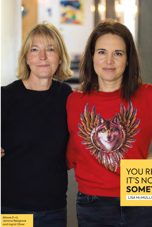
Above (l-r): Jemma Redgrave and Ingrid Oliver

“What I like about these stories is that they are all so epic. This four-part box set just goes to places that you wouldn’t expect. So many twists and turns – you think it’s one story and then suddenly it explodes and it’s an entirely other story – it’s like a Russian doll. You get to the end of this box set and you realise, ‘Oh wow, it’s not even that, it’s something else entirely.’