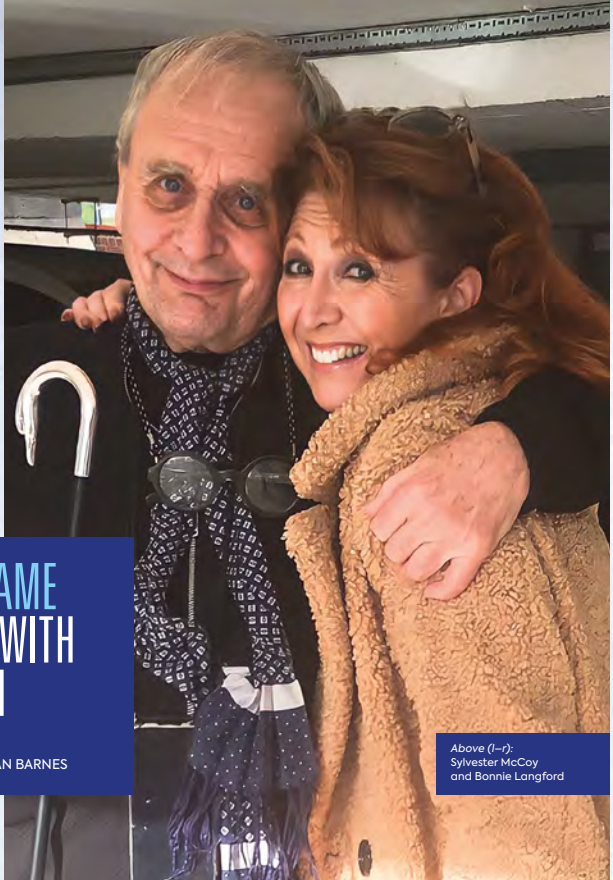
Above (l-r): Sylvester McCoy and Bonnie Langford