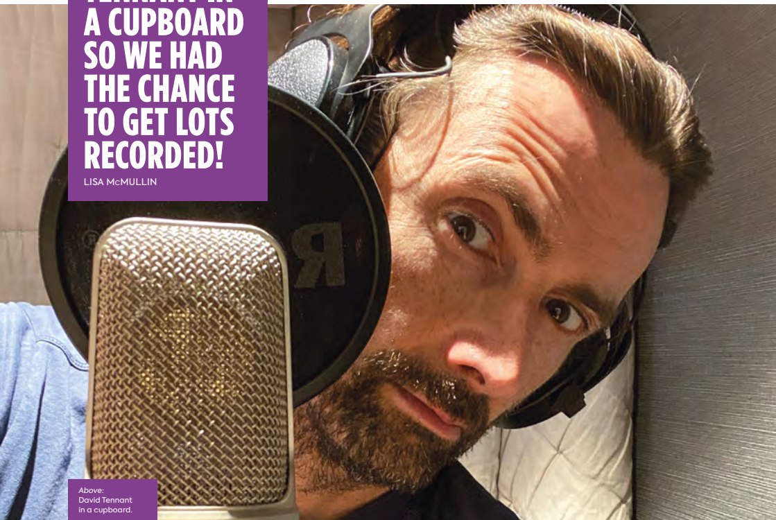
Above: David Tennant in a cupboard.