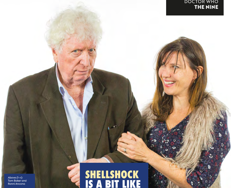
Above (l-r): Tom Baker and Ronni Ancona