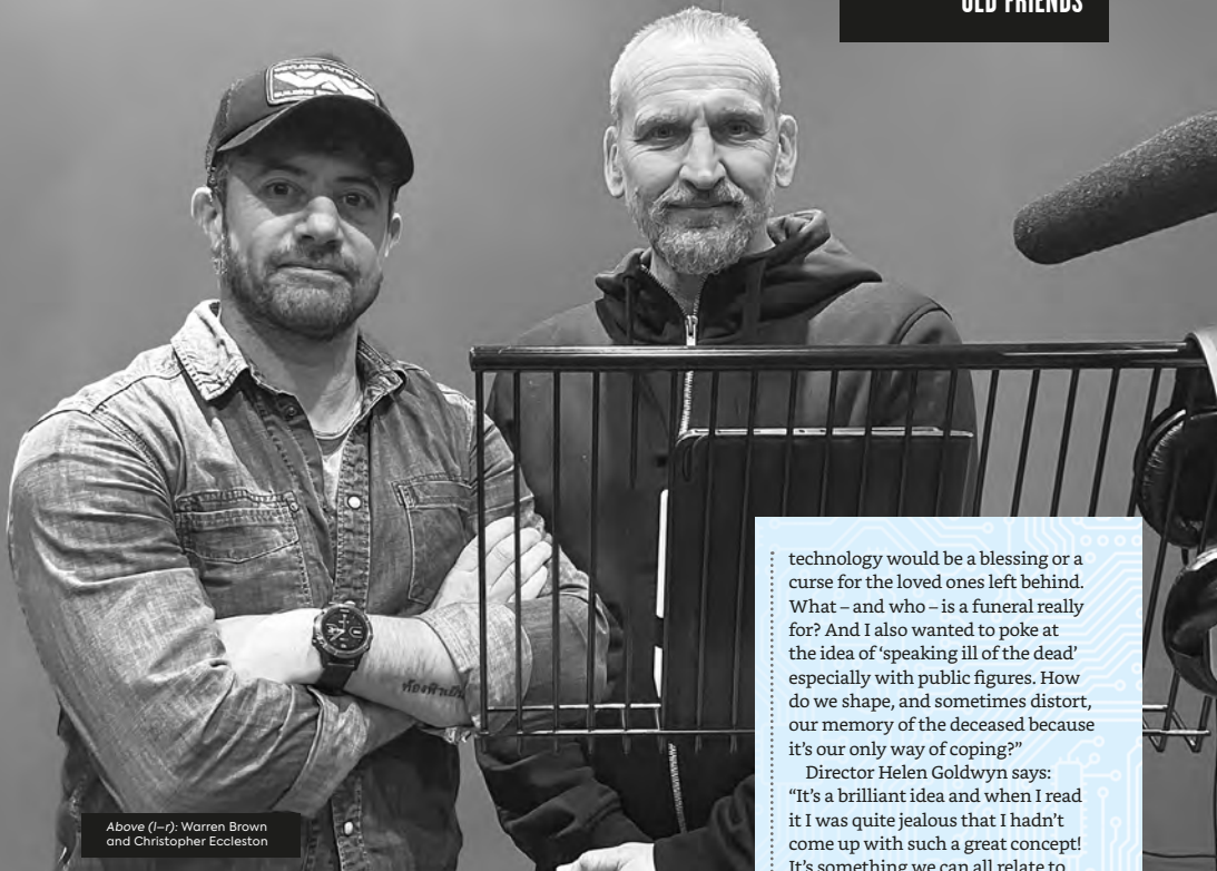
Above (l-r), Warren Brown and Christopher Eccleston

Who came back to our screens. At school I kept my Who love a secret so I wouldn't make myself a target for passing bullies. But then the show returned and became a massive hit! Nobody can deny the enormous impact that Chris made in that role. I loved him. The energy, the attitude, the big grin full of teeth. We didn't really have any money growing up and it meant so much to have a Doctor who wasn't doing the frock coats and pocket watches thing.