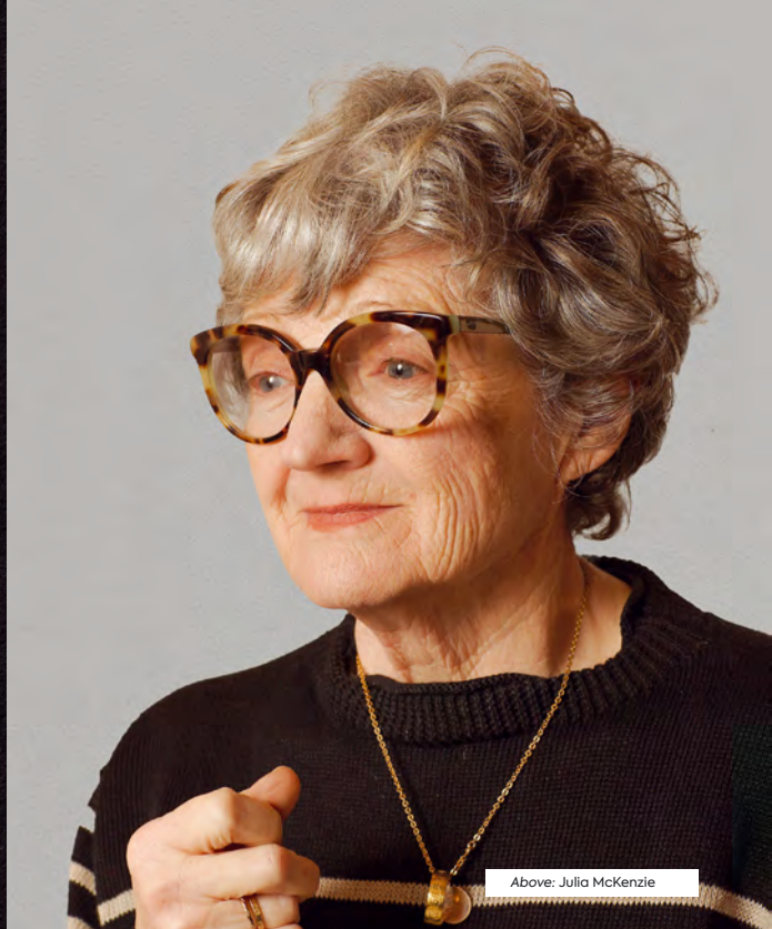
Above: Julia McKenzie

Julia McKenzie reprises her role as the Twelve (the multiple-personality Time Lord whose previous incarnations exist all at once) introduced in the first