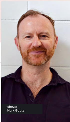
Above: Mark Gatiss

Count, as he adds: "Anyone who's enjoyed these Dracula stories is cordially invited to check out my new novel, Dracula's Child , which is