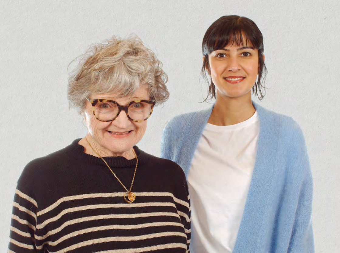
Above (l-r): Julia McKenzie and Rakhee Thakrar