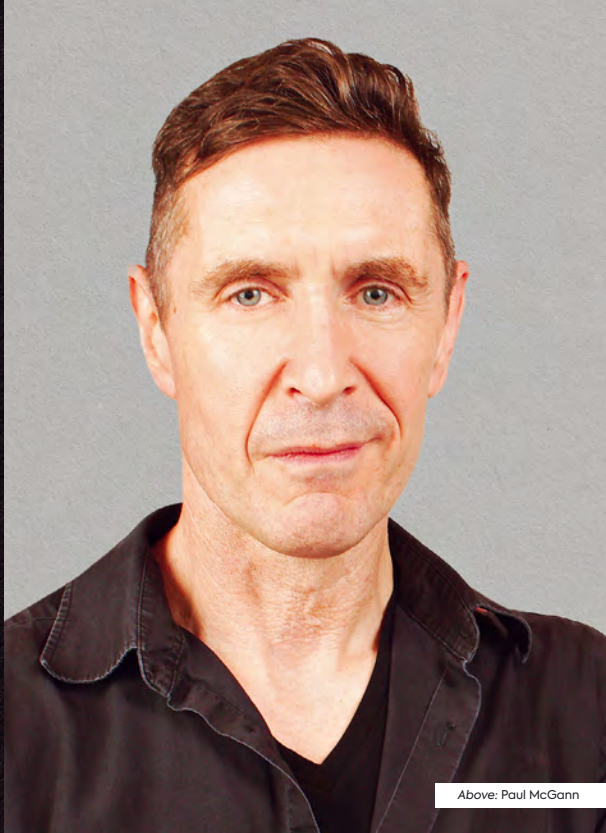
Above: Paul McGann