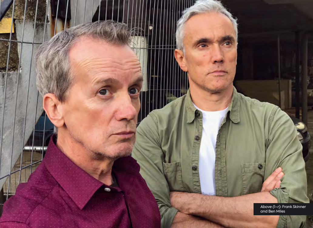
Above (l-r): Frank Skinner and Ben Miles