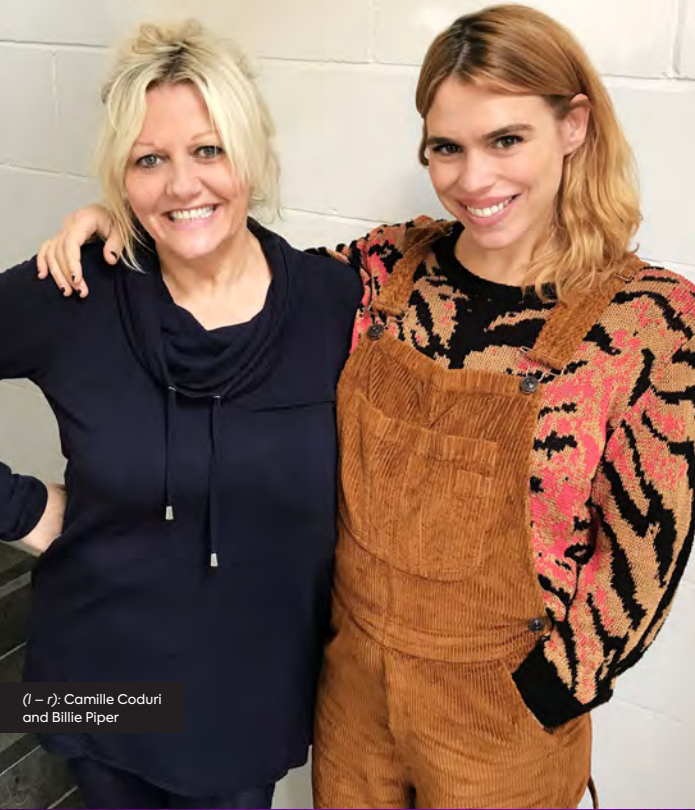
(l - r): Camille Coduri and Billie Piper