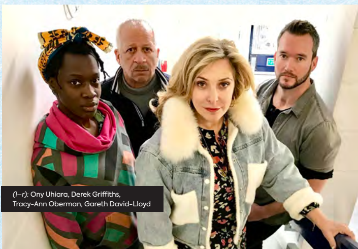
(l-r): Ony Uhiara, Derek Griffiths, Tracy-Ann Oberman, Gareth David-Lloyd