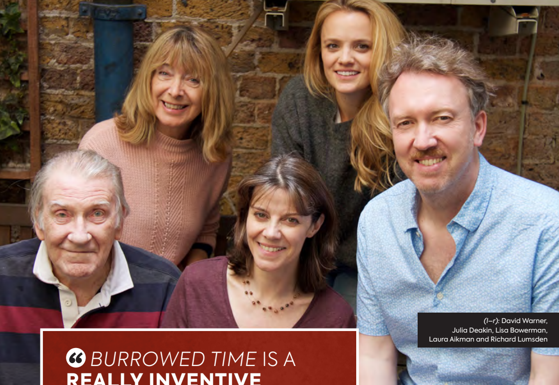
(l-r): David Warner, Julia Deakin, Lisa Bowerman, Laura Aikman and Richard Lumsden