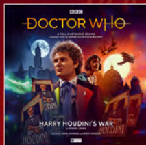
HARRY HOUDINI'S WAR OUT IN SEPTEMBER