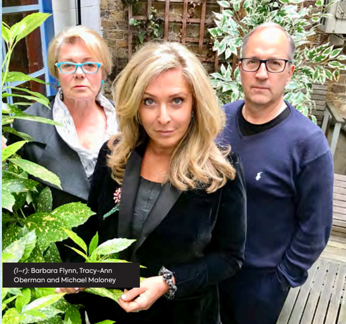
(l-r): Barbara Flynn, Tracy-Ann Oberman and Michael Maloney

"Just what happens when someone retires from Torchwood? There's a high mortality rate among its agents, but what about the cleaner? That's when we meet Dave Cook, who Yvonne and Ianto find in a care home, and they try to prise information from his memory.