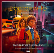
EMISSARY OF THE DALEKS OUT IN AUGUST