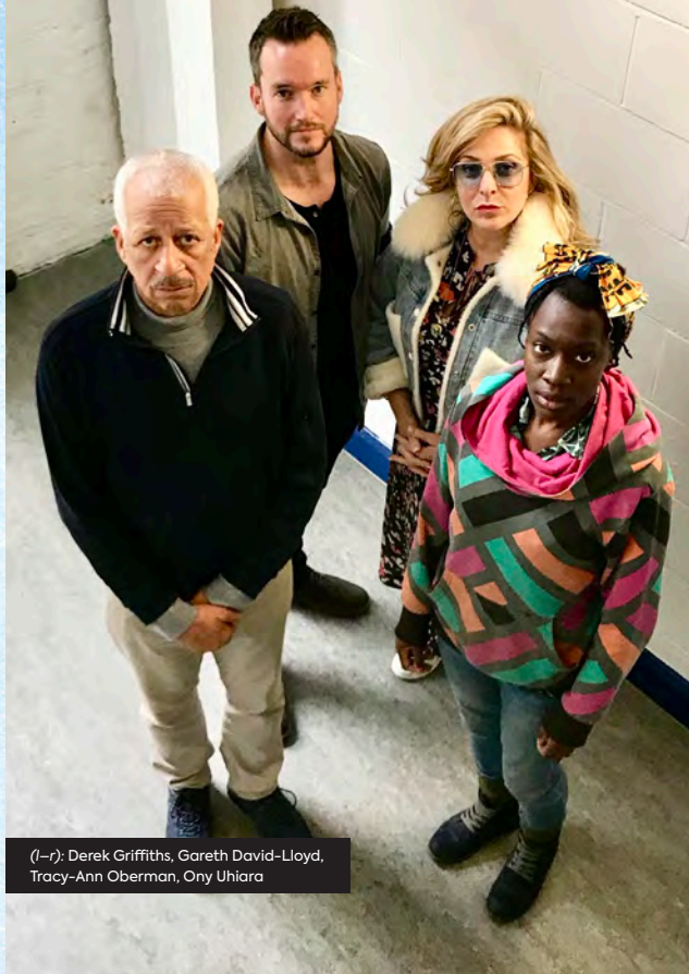
(l-r): Derek Griffiths, Gareth David-Lloyd, Tracy-Ann Oberman, Onyiah Uhiara

detailed brief – just that it was all to do with retirement – and that was it!