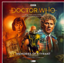
MEMORIES OF A TYRANT OUT NOW!