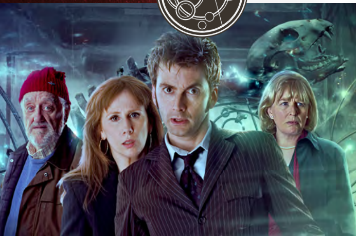
Above: David Tennant