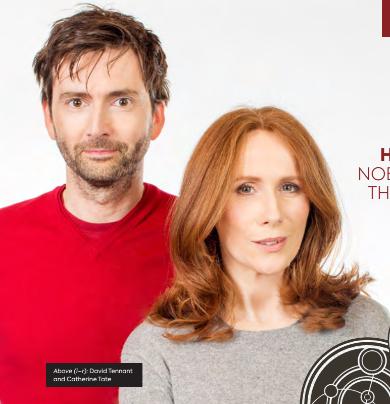
Above (l-r): David Tennant and Catherine Tate

“I’M LIKE ANY FAN, DYING TO HEAR WHAT THE NOBLES, WILF AND THE DOCTOR GET UP TO. WHAT A DREAM CAST!”