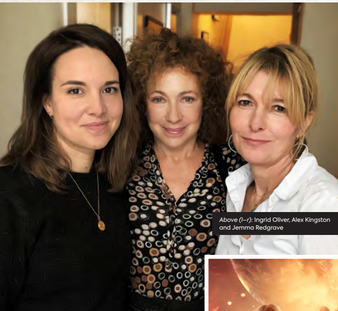
Above (l-r): Ingrid Oliver, Alex Kingston and Jemma Redgrave