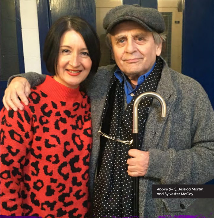
Above (l-r): Jessica Martin and Sylvester McCoy