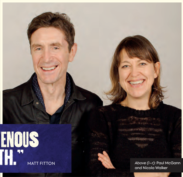
Above (l-r): Paul McGann and Nicola Walker