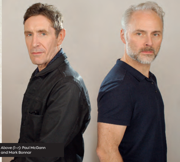
Above (l-r): Paul McGann and Mark Bonnar