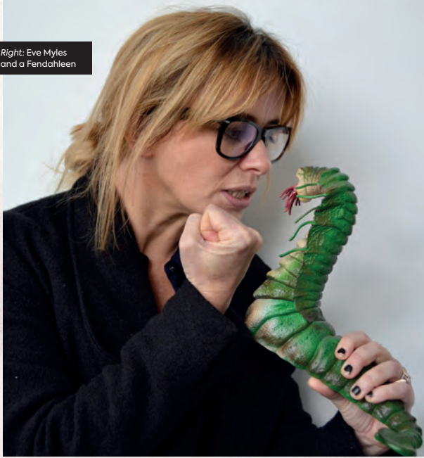
Right: Eve Myles and a Fendahl

its hopelessness and its horror and asked for more cleavage?"