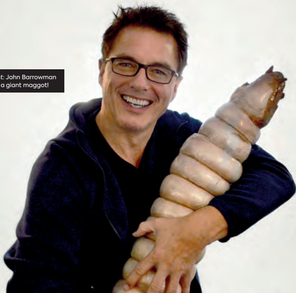
Right: John Barrowman and a giant maggots!