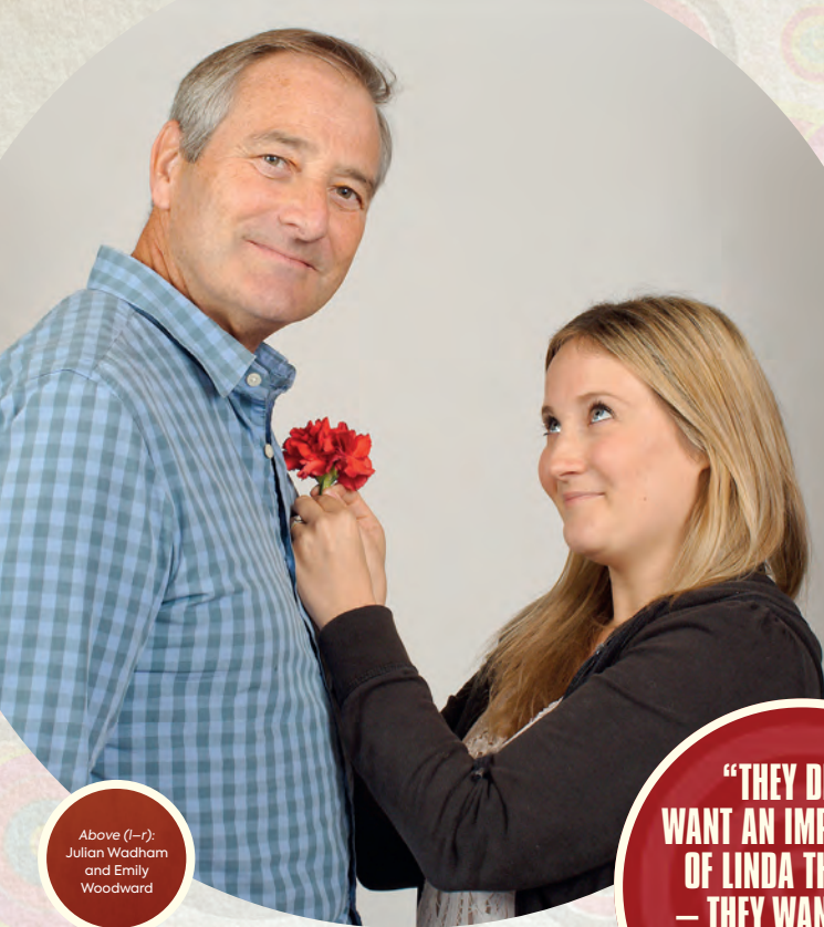
Above (l-r): Julian Wadham and Emily Woodward

"I'm told I've quite a young-sounding voice, so I think that matched her quite well. Although she's an Avenger, she's still finding her own way. She has a twinkle in her eye, but she's young and getting out there on her own."