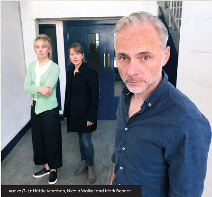
Above (l-r): Hattie Morahan, Nicola Walker and Mark Bonnar

"I get to start things off in a slightly calmer way. After the