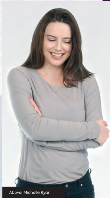
Above: Michelle Ryan