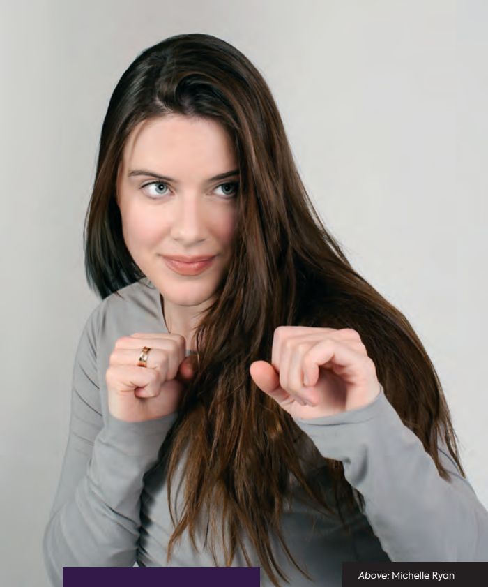
Above: Michelle Ryan