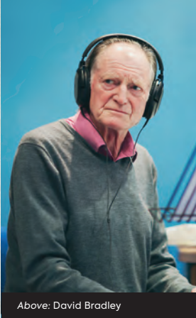
Above: David Bradley