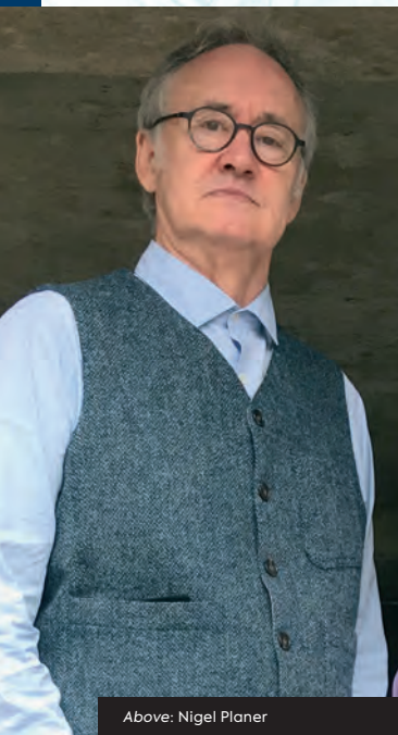
Above: Nigel Planer