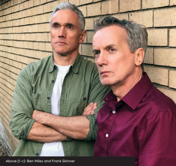
Above (l-r): Ben Miles and Frank Skinner