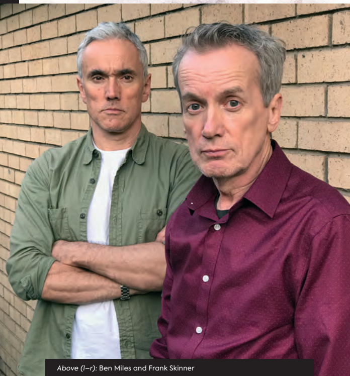
Above (l-r): Ben Miles and Frank Skinner