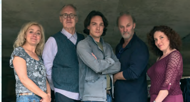
Above (l-r): Sophie Thompson, Nigel Planer, Sebastian Armesto, Tim McInnerny and Helen Goldwyn