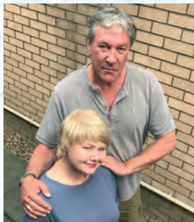
Above (l-r): Annette Badland and Tim Bentinck