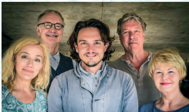
Above (l-r): Sophie Thompson, Nigel Planer, Sebastian Armesto, Tim Bentinck and Annette Badland

sometimes you see someone and you think you remember their face?