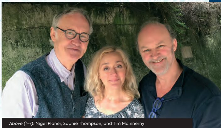
Above (l-r): Nigel Planer, Sophie Thompson, and Tim McInnerny

"It was great fun, and I think the end result is rather special. It's very colourful, vivid and funny, and a little bit outrageous. There's also a magical The Box of Delights quality to it. It's such a strong idea it has the potential to go even further. It could be a TV series or a film! There is certainly scope for a second series. So I hope this is just the beginning, and having developed such a good working relationship with Nigel, it would be nice to keep going!" Nigel