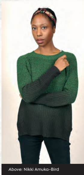
Above: Nikki Amuka-Bird