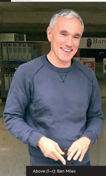
Above (l-r): Ben Miles