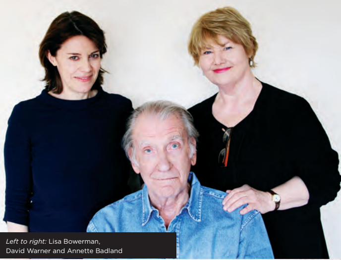
Left to right: Lisa Bowerman, David Warner and Annette Badland

“ I KNOW I ALWAYS SAY IT, BUT IT SHOWS YOU JUST HOW STRONG A CHARACTER PAUL CORNELL CREATED ALL THOSE YEARS AGO. ”