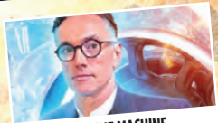
THE TIME MACHINE ADAPTING THE CLASSIC FOR AUDIO