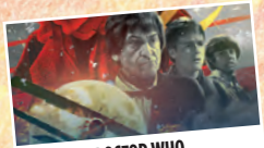
DOCTOR WHO BRAND-NEW EARLY ADVENTURES