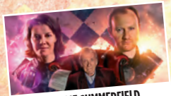
BERNICE SUMMERFIELD UNBOUND ADVENTURES