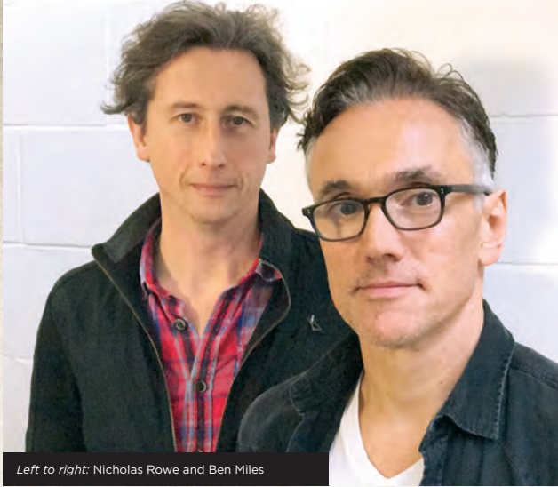
Left to right: Nicholas Rowe and Ben Miles