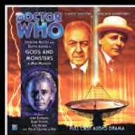
GODS AND MONSTERS SEPTEMBER 2012

ORDER FROM BIGFINISH.COM AND ALL GOOD BOOKSHOPS CREDIT CARD HOTLINE 01628 824102