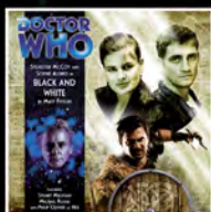
BLACK AND WHITE AUGUST 2012