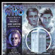
PROTECT AND SURVIVE JULY 2012